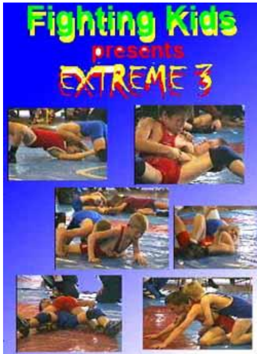
“ EXTREME 3 (2000 - 70 min)