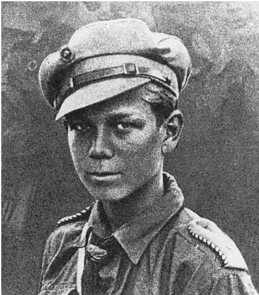
"HITLERJUNGE QUEX" – the slightly rakish tilt to the cap the only surviving vestige of humanity in a portrait as cold and hard as a rifle butt.